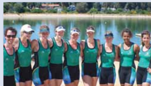
University of Western Australia Team