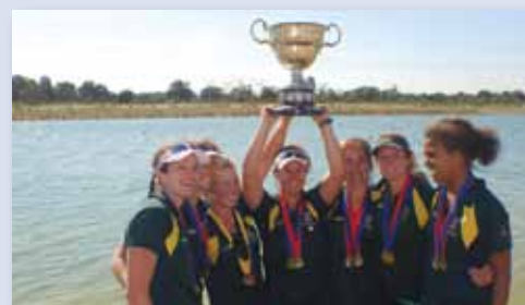
Winning UWA crew