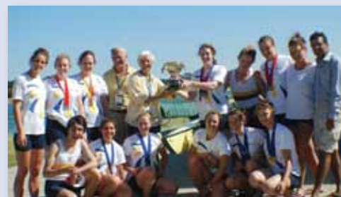
Sydney University Team